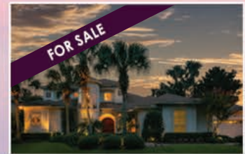
2331 Lakeshore Drive 4BR/4BA • 3,452 SF • $1,100,000