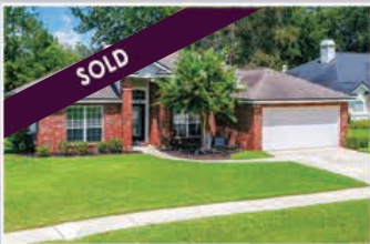
1592 Shelter Cove Drive 4BR/2BA • 2,242 SF