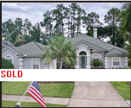
2372 STONEY GLEN DR FLEMING ISLAND, FL 32003 MLS #1021444