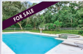
2516 Begonia Drive 4BR/2BA • 2,620 SF • $350,000