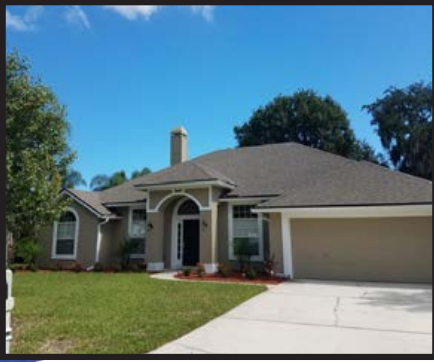
1575 LAKE BEND PL FLEMING ISLAND, FL 32003 MLS #1020883