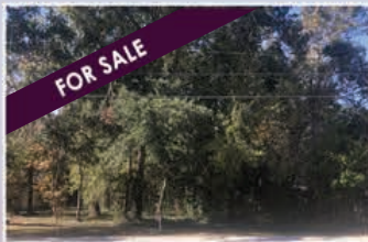
0 Plainfield Avenue Vacant Land • $49,900