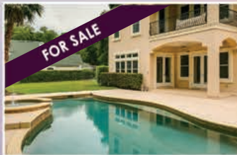
1610 Pebble Beach Blvd. 5BR/4BA • 4,472 SF • $750,000