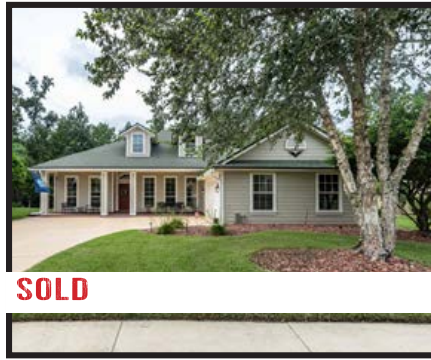
2364 COUNTRY SIDE DR ORANGE PARK, FL 32003 MLS #1019870