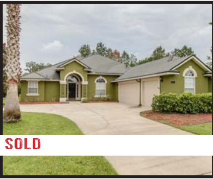
1380 HOLMES LANDING DR FLEMING ISLAND, FL 32003 MLS #1004576