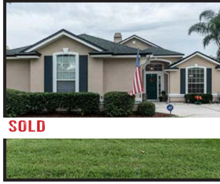
1433 CREEKS EDGE CT ORANGE PARK, FL 32003 MLS #1021764