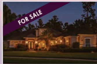
2651 Country Side Drive 5BR/5BA • 4,293 SF • $665,000