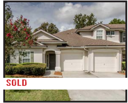
2412 OLD PINE TRAIL FLEMING ISLAND, FL 32003 MLS #1015493