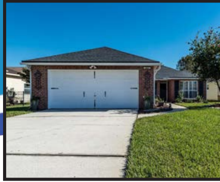
1647 RUSTLING DR , ORANGE PARK, FLORIDA, 32003 MLS #1026576