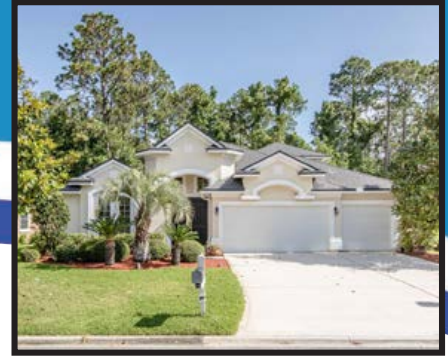
1988 VISTA LAKES DR FLEMING ISLAND, FL 32003 MLS #993127