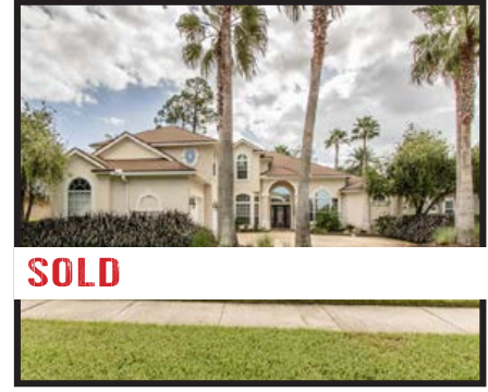
1763 EAGLE WATCH DR FLEMING ISLAND, FL 32003 MLS #1016783