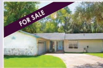
2980 Oak Road 4BR/2BA • 2,612 SF • $200,000