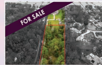
5675-A Pine Avenue Vacant Land 2.5 Acres • $290,000