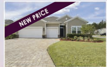
7100 Swan Falls Court 4BR/3BA • 2,249 SF • $283,000