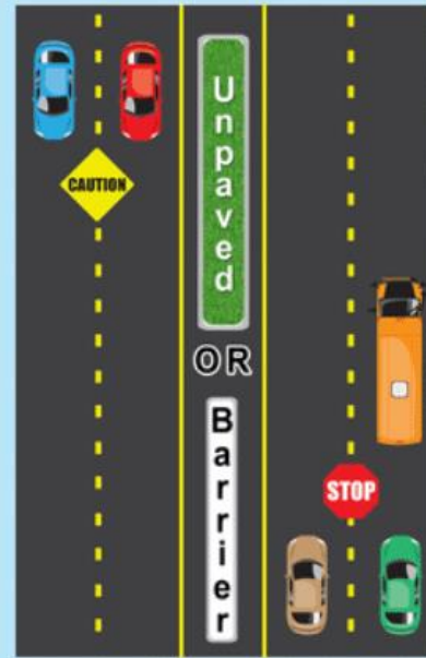
DIVIDED HIGHWAY Unpaved space (Min 5ft) OR any raised median/physical barrier. Vehicles behind bus MUST stop. Vehicles traveling in the opposite direction proceed with caution.

School bus traffic violations can be both dangerous and costly. Remember your bus safety rules, be cautious and drive safely. Let's have a great school year at Aberdeen!