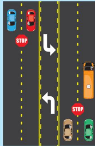
MULTI-LANE Paved Across: Vehicles traveling in both directions MUST stop