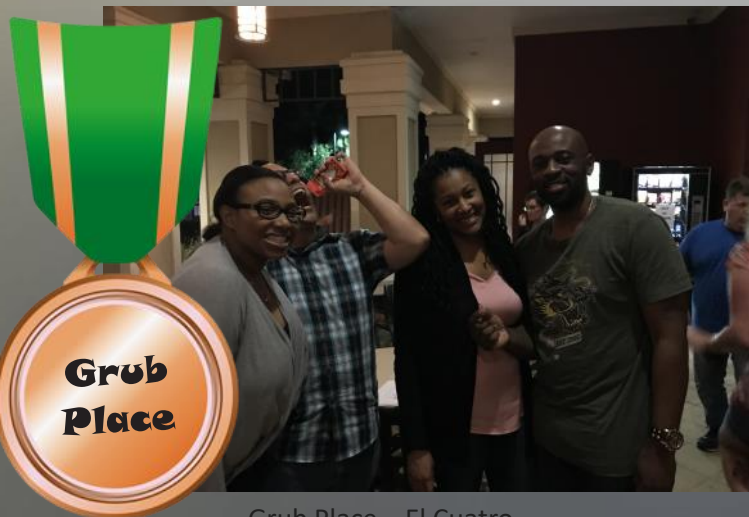
Grub Place – El Cuatro