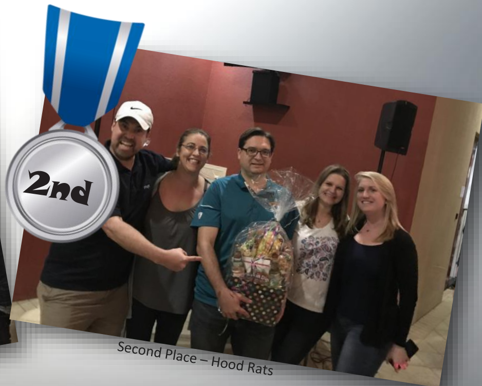
Second Place – Hood Rats