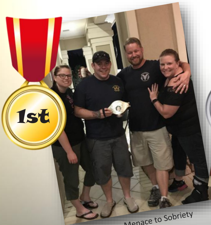
First place – Menace to Sobriety

We had a great time at Trivia Night at Aberdeen. If you missed this session, be sure to join us on Friday, April 20th at 7:00pm for more trivia fun! Food Trucks too, so make a night of it.