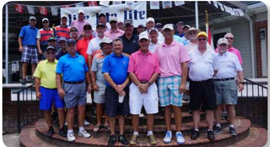
Thank you to all participants!